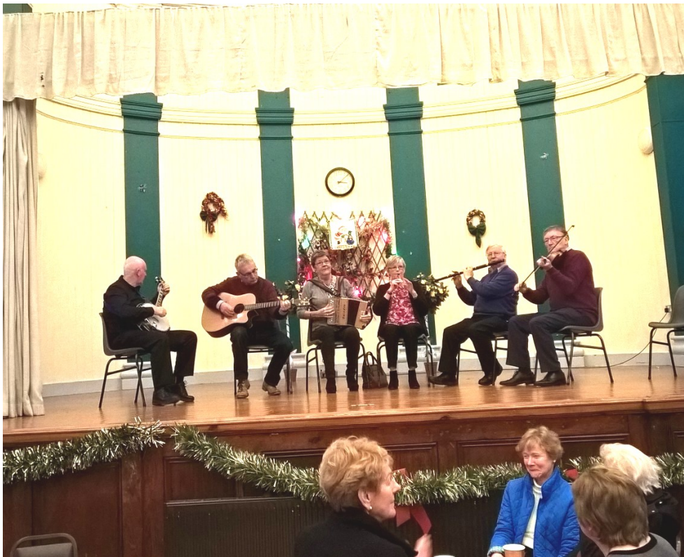
Traditional Irish musicians entertain our volunteers

On Thursday 10th December volunteers gathered in the Gillooly Hall for the annual volunteer Christmas lunch. Entertainment was provided by "Something to Sing About" and a group of traditional Irish musicians. There was a selection of delicious finger food prepared by Sligo Social Services kitchen staff and a raffle of hampers wine and vouchers for dinner in the Sligo Park Hotel. A good time was had by all.