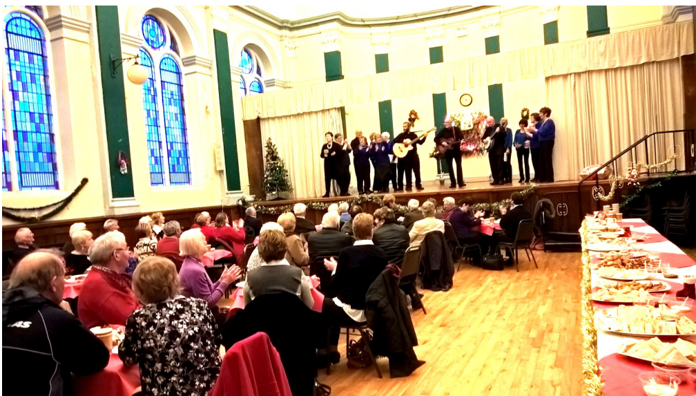
Volunteers enjoy the delightful harmonies of "Something to sing about"